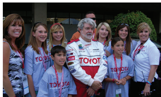
Legendary movie director George Lucas pictured with young admirers prior to the Toyota Pro-Celebrity Race.